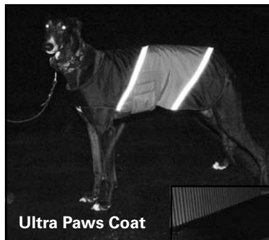
Ultra Paws Coat

We purposely photographed these products on a black dog to show how much more visible a dog is when wearing a reflective product when walking near cars at night.