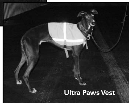
Ultra Paws Vest